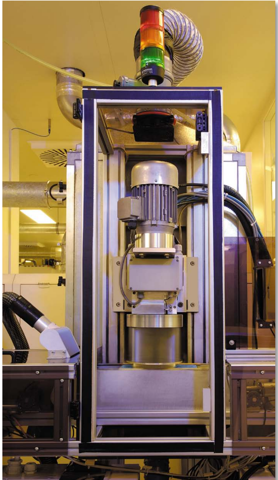
Figure 7: The circuit boards undergo a continuous process, via the plasma system, through to the screen printing plant. The space-saving plasma plant serves four screen printing lines.