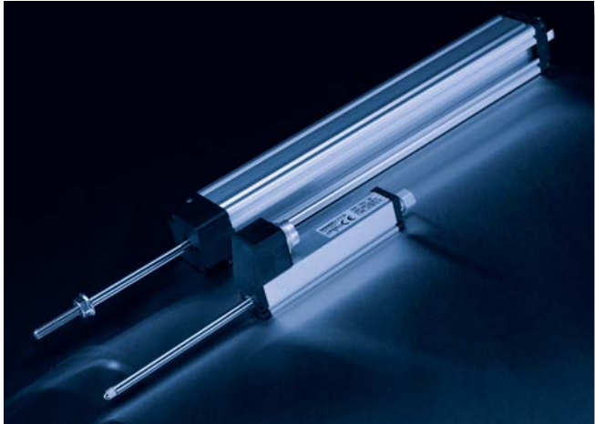
Figure 2: Position transducers operate under harsh environmental conditions and at high positioning speeds. (Novotechnik)

Germany's Novotechnik ( www.novotechnik.com ) had already been focusing on environmentally-friendly production in the 1990s, when circuit boards were pretreated with low-pressure plasma in a vacuum chamber. This method was indeed efficient, but while vacuum chambers are perfectly suited for batch processes, they are less suited for the pretreatment of large quantities. With overly lengthy process times, integration into the existing screen printing lines was not possible either. Adding to this was the labor-intensive nature of the operation, since one person had to equip and another one had to empty the low-pressure chamber. After deciding to increase production from the year 2000 onward, the company discovered a plasma process that did not have the above limitations.