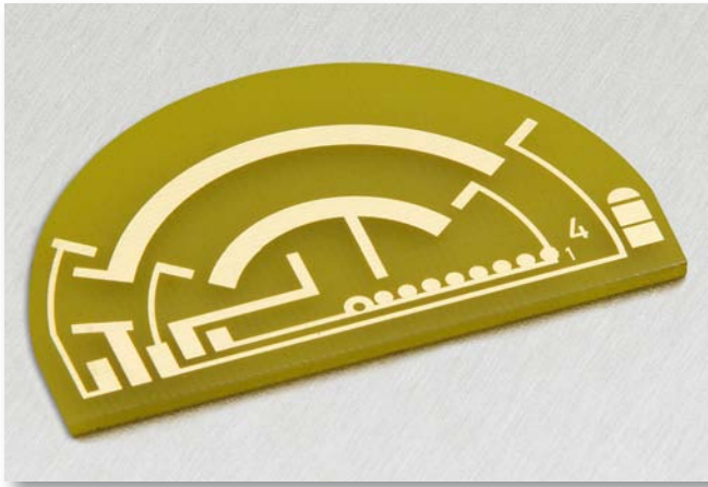
Figure 6: The Openair process takes at most one second for the activation of the panel, which may contain up to 70 circuit board blanks. Thereafter, the circuit boards are transported to the printing plant where printing with conductive ink takes place by applying the screen printing process. (Plasmatreat)

manufacturer, for example, demanded evidence for a throttle valve product that the component is capable of being operated at more than 10 million cycles on the motor with no significant changes in its electrical properties (Figure 4). This number corresponds to a traveled distance of about one million kilometers.