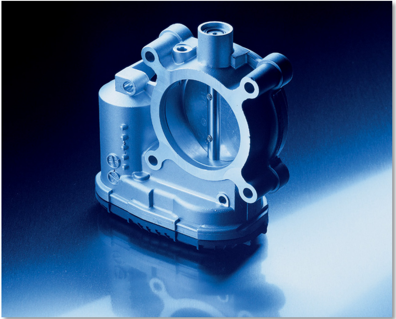
Figure 4: Complete throttle valve with flap, integrated actuator and sensor. Pretreatment with atmospheric plasma is effected before the integrated sensor circuit board is coated. (Novotechnik)

compatible plastics without bonding, simply by using plasma. Apart from the strong activation and microfine cleaning effects, the user benefits from the high electrostatic discharging effect of the free plasma beam, and also its ultrasonic emission speed, which effectively removes all loose and microfine particles from the surface. In close collaboration with the research institute Fraunhofer IFAM, Bremen, the technique was developed further: For the purpose of the functionalization of surfaces, the world's first atmospheric plasma-polymerisation process was patented and brought into large industrial use at TRW Automotive.